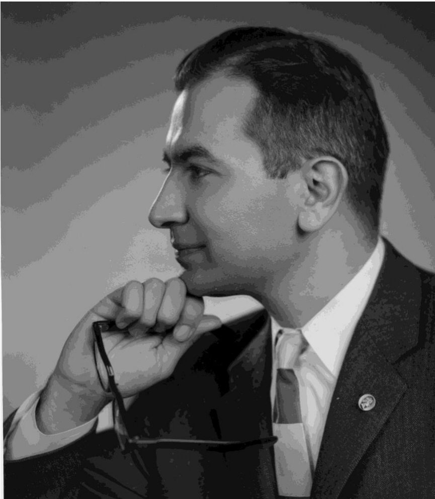
Thomas Saaty in 1959 - Age 33 in London while working at the US Embassy for the Office of Naval Research